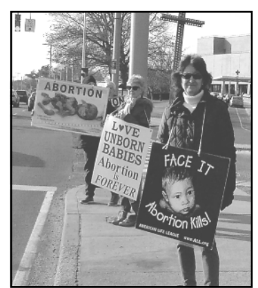
Roe V. Wade Mem. NUMC 1/21/18 2019 Date: 1/20/19