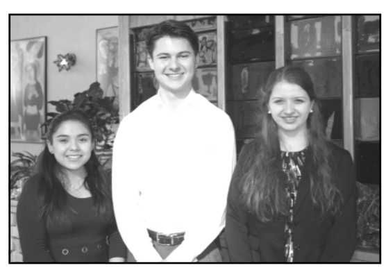
Oratory Contest 3/18/18 2019 Date: 3/24/19