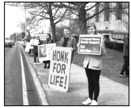
Good Friday at NUMC 3/30/18 2019 Date: 4/19/19