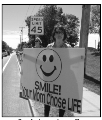
Pre-Independence Day Manorville 7/3/18 2019 Date: TBA